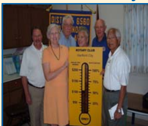
Above: Hartford City Rotarians