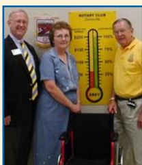
At right: Zionsville