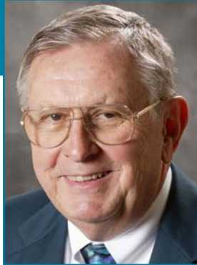
Governor Bing Pratt

Volume XX, Number 9 • Rotary Year 2006-2007